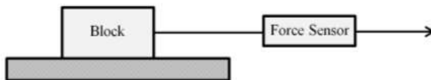
Figure 1. Schematic setup for measuring the limit of the static friction.